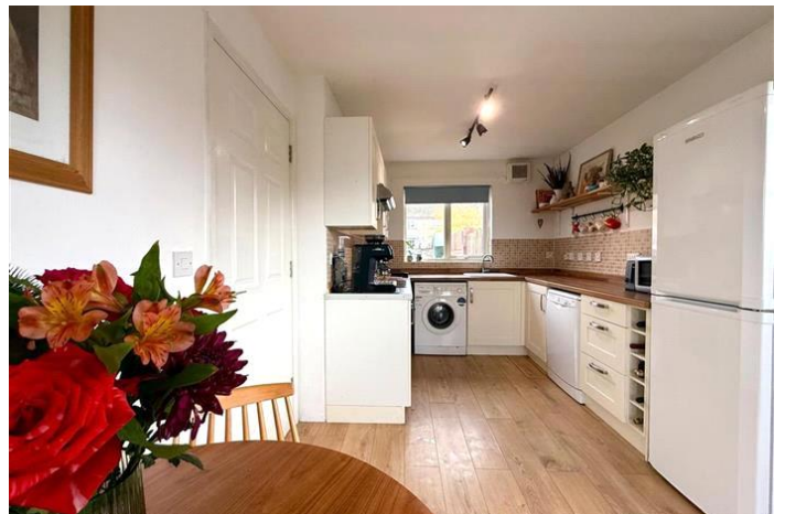
REDHILLS, BROAD TOWN GUIDE PRICE £290,000 Freehold