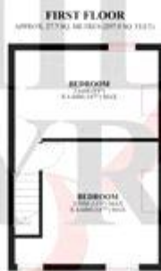
TOTAL AREA: APPROX. 67.1 SQ. METRES (722.5 SQ. FEET)