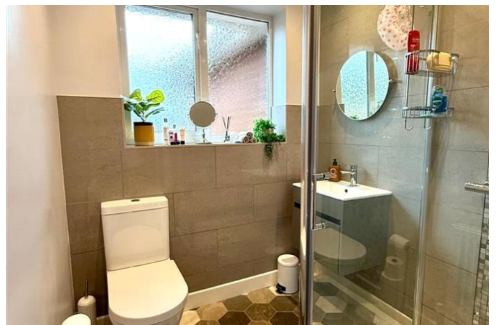
FARLEIGH CRESCENT, LAWN, SWINDON GUIDE PRICE £315,000 Freehold