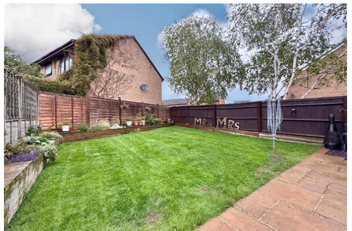
LINEACRE CLOSE, GRANGE PARK, SWINDON GUIDE PRICE £300,000 Freehold