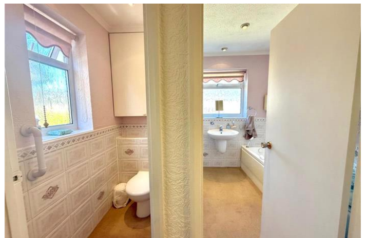
OVERBROOK, ELDENE, SWINDON £295,000 Freehold