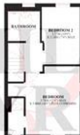
FIRST FLOOR APPROX. 25.4 SQ. METRES (274 SQ. FEET)

TOTAL AREA: APPROX. 50.7 SQ. METRES (543.9 SQ. FEET) All figures are for information purposes only and are based on current planning and building regulations. All figures are approximate and do not include the area of any external spaces. Plans produced using Plot 2.