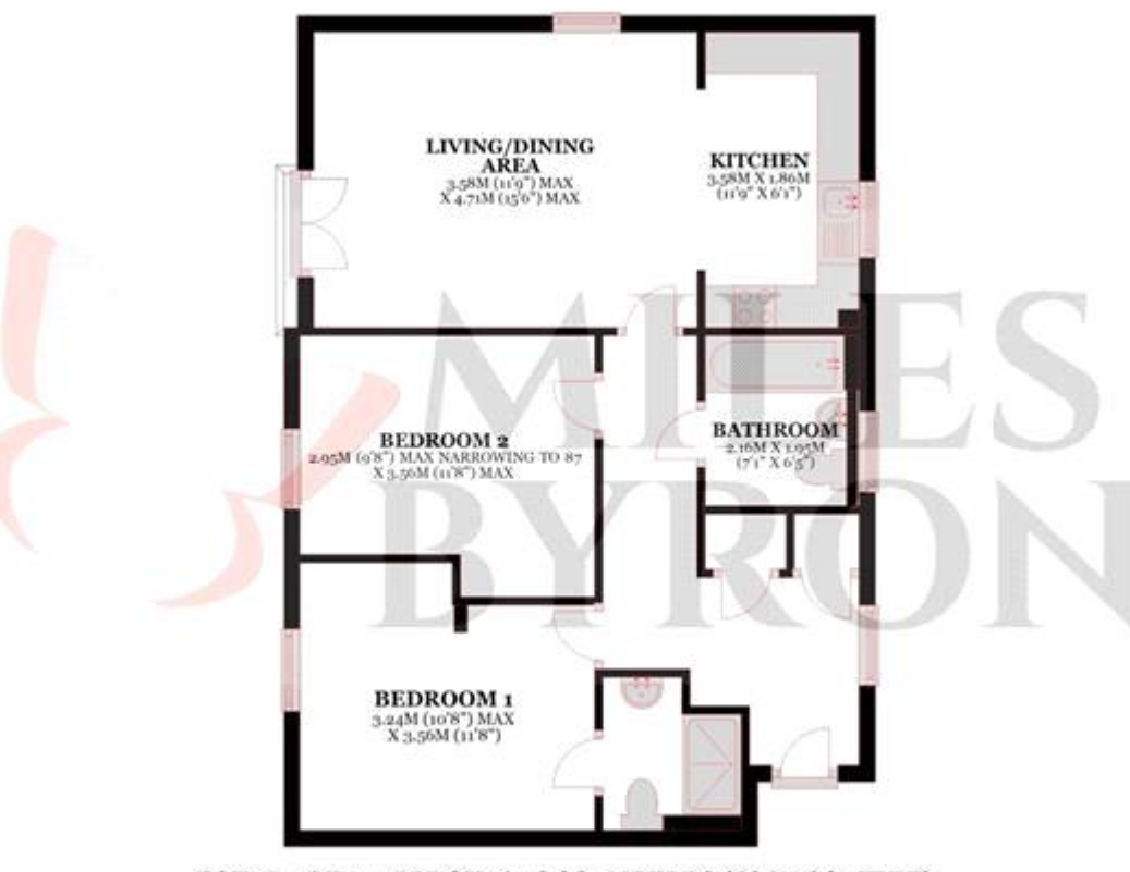
TOTAL AREA: APPROX. 63.8 SQ. METRES (686.9 SQ. FEET)

APPROX. 63.8 SQ. METRES (686.9 SQ. FEET)