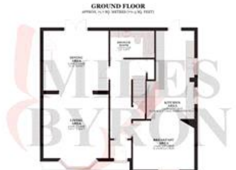
TOTAL AREA: APPROX. 118.5 SQ. METRES (1275.6 SQ. FEET)