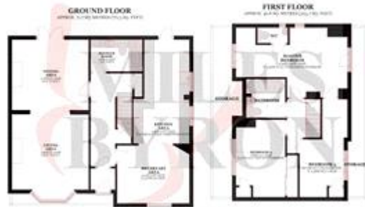
TOTAL AREA: APPROX. 118.5 SQ. METRES (1275.6 SQ. FEET)